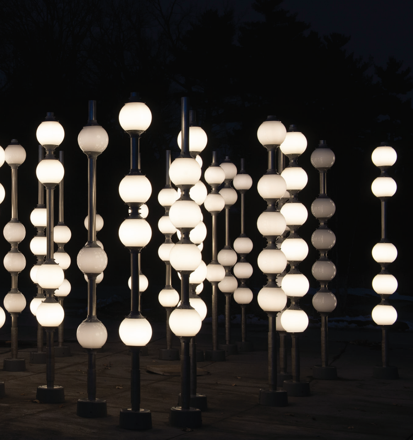
Hung at various heights in a thicket of 10-foot-tall steel poles, the installation's illuminated polycarbonate orbs light the night.